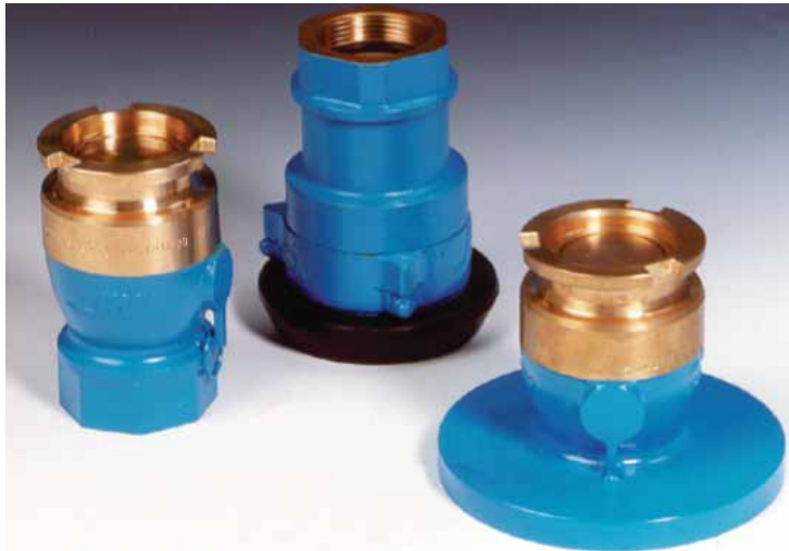
1 1/2-inch self sealing industrial couplings