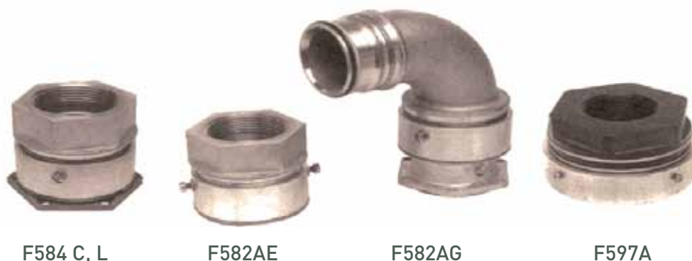
F584 C, L